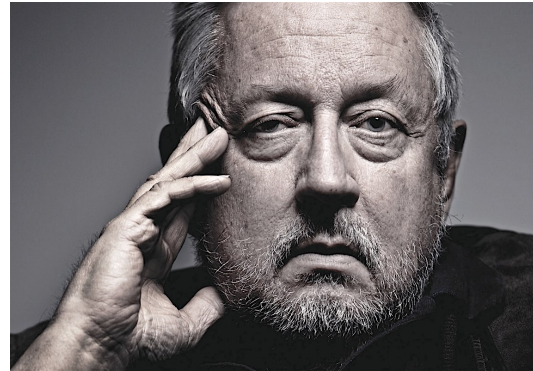
Author Leif G. W. Persson

well be on the line. Taking on a new investigation could prove fatal.